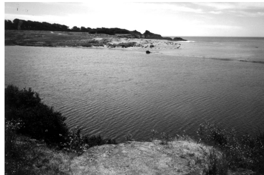
Gualala Bluff Trail.

Please contact me at 884-4824 or msittner@mcn.org if you are interested in volunteering or to learn more. 🌲