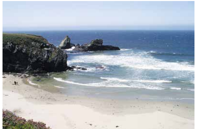
View of Cooks Beach from the top of the bluff.