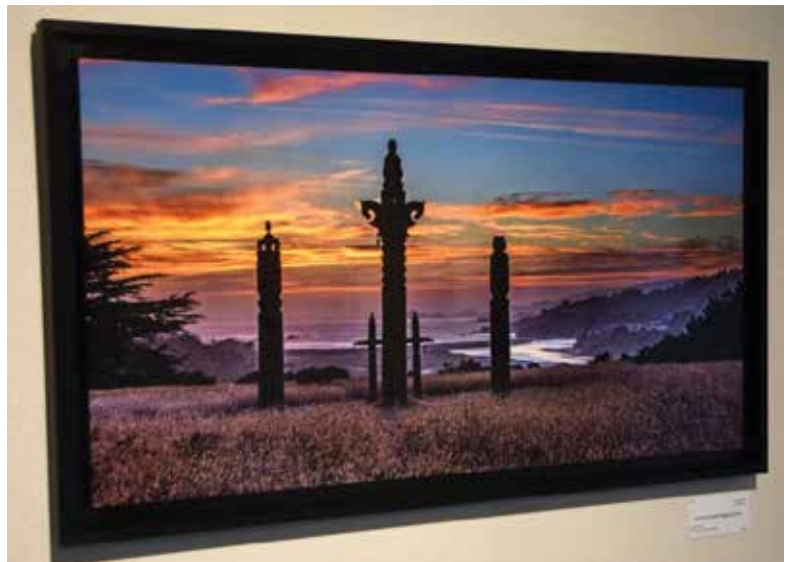
Dusk at Gualala Point Park

Send us an email at rclc@rclc.org with the email address you prefer and the names attached to that email. If your mailing address and phone have changed, please send that along as well.