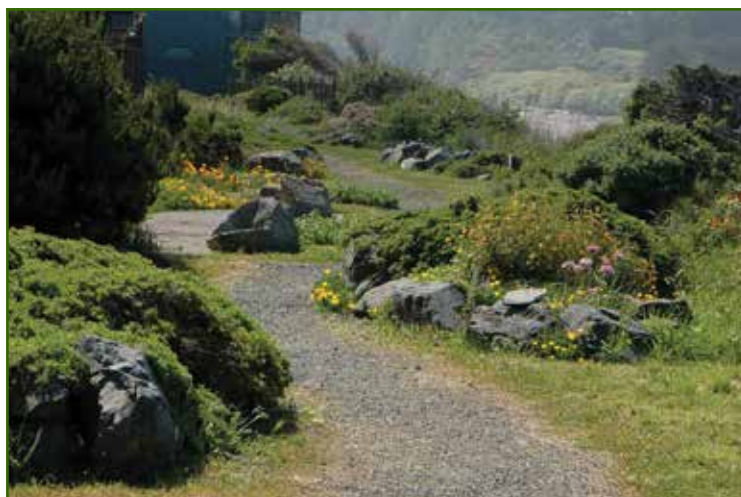
Native plants and boulders placed by RCLC volunteers along the Gualala Bluff Trail.