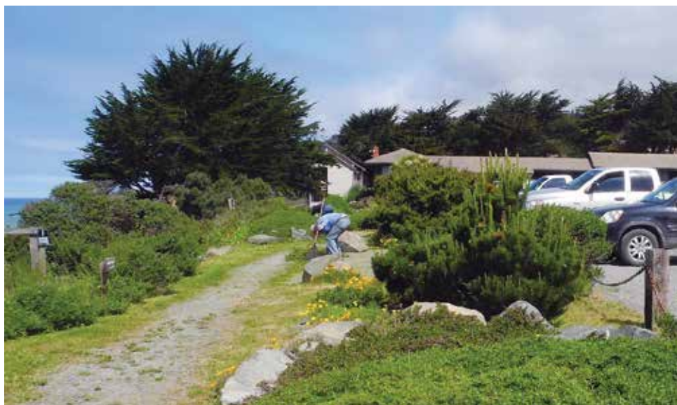
The Geoweb system proposed for the bluff face would remove vegetation planted and maintained by RCLC volunteers along the Gualala Bluff Trail behind the Surf Super.

After the Fort Bragg meeting presentation, the Commission staff indicated that the review of the proposal could proceed since the contamination issue had been resolved. RCLC was encouraged by these comments and has submitted a follow-up letter to the Commission to urge that the "de novo" evaluation and hearing be conducted as soon as possible so that this long-standing issue can be resolved.