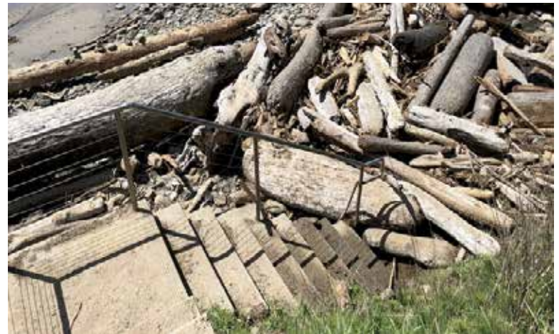
A jumble of logs washed up after a rainstorm prevents easy access to the beach.

Stormy seas often deposit driftwood on Cooks Beach. This summer RCLC Volunteers Joel Chaban and Brent Klopfer tackled the log jam at the bottom of the stairs and cleared a pathway to the beach.