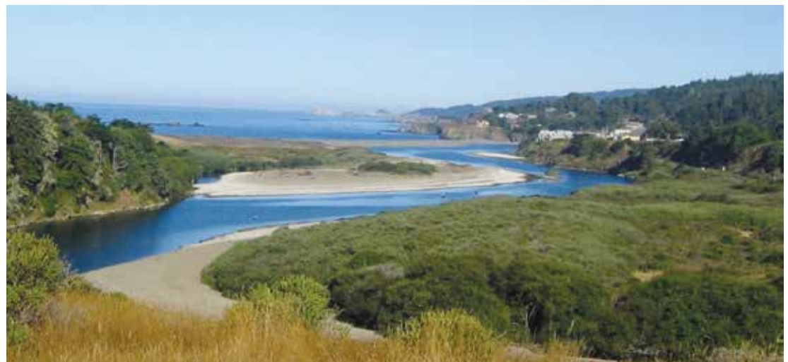
Mill Bend, a place of rich biodiversity and striking beauty, where the Gualala River takes a sweeping turn as it heads out to sea.

found to protect the scenic beauty and valuable habitat of the Gualala River Estuary and forever preserve the Mill Bend properties for community use and enjoyment.