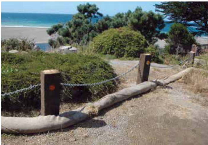
Replacing bollards that keep the trail separate from Surf Super's parking lot has become an important part of maintaining the Gualala Bluff trail. Twice during this past year RCLC has put in new bollards to replace ones that had been damaged.