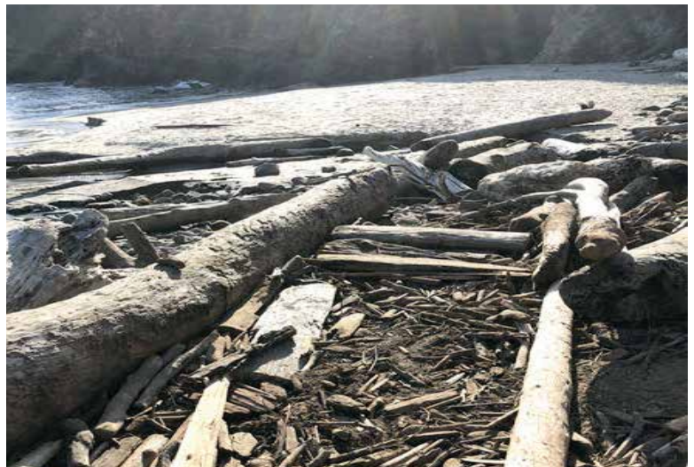
A space is cleared between the logs